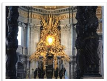
The altar at St. Peter's Basilica; long view of the enormity and grandeur of this space.

We recently returned home from a life-changing tour of Italy. We spent time in Rome, Florence, and Venice, singing in four venues. A highlight was singing in a Mass in St. Peter's Basilica at the Vatican!!!