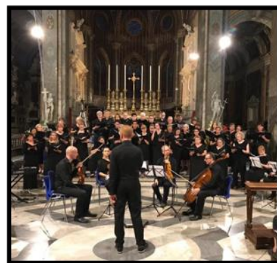
Concert time at Santa Maria sopra Minerva